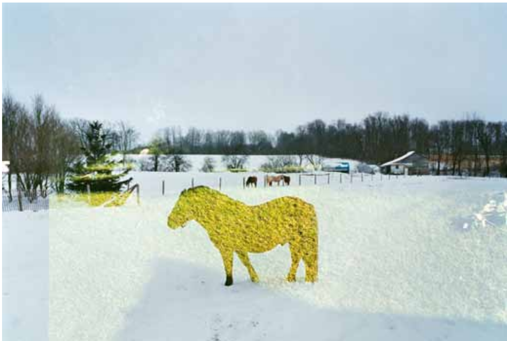
Tierney Gearon Frame 63, from the Explosure Series

Date: 2008 Edition: 2 of 5 Size: 20 x 24 inches Medium: archival pigment fiber print Value: $4,000