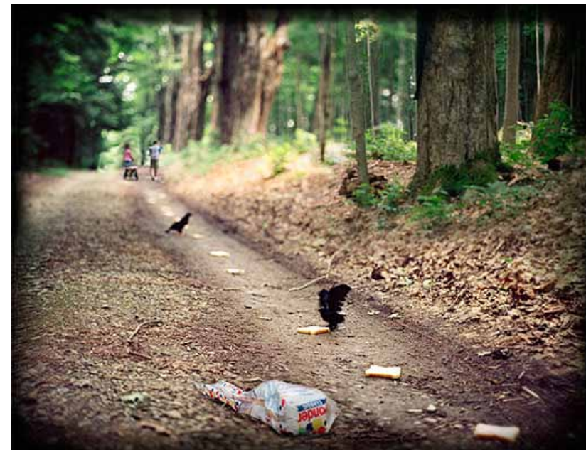
Krista Steinke "they wondered where the path would lead"

Date: 2006 Edition: 5 of 6 Size: 22 x 28 inches Medium: archival pigment print Value: $2,000