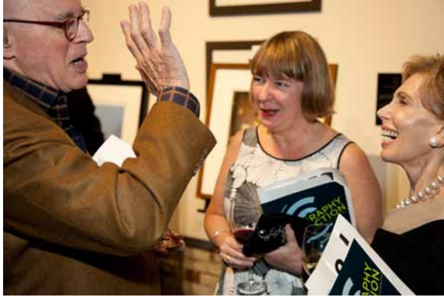
Martin Parr USA. Atlanta. The ACP Photography Auction.

Date: 2010, print 2012 Edition: 1 of 10 Size: 30 x 20 inches Medium: chromogenic print Value: $6,000