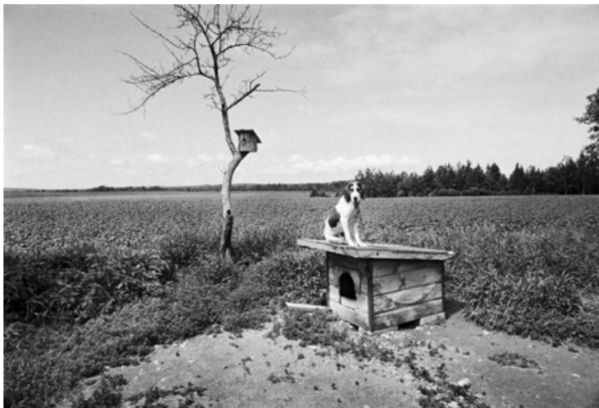
Arthur Grace Coon Dog, Aroostock County, Maine

Date: 1974 Edition: 4 of 25 Size: 11 x 14 inches Medium: gelatin silver print Value: $1,700