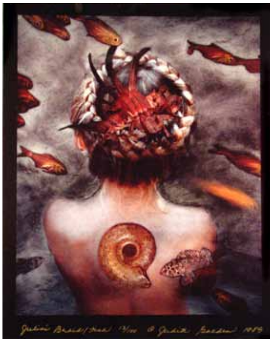
Judith Golden Julia's Braid/Fish

Date: 1989 Edition: 13 of 100 Size: 16 x 20 inches Medium: photography and mixed media cibachrome print Value: $1,500