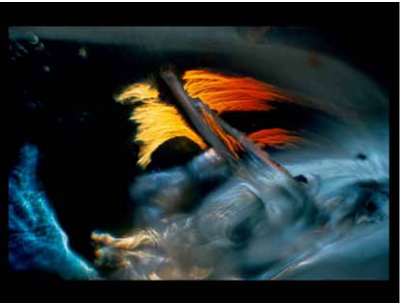
Wynn Bullock Color Light Abstraction 1071