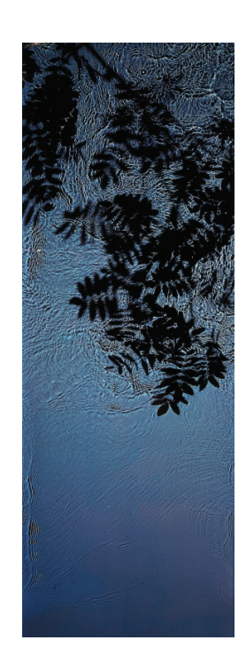
Susan Derges River Taw Ivy 17.7.97 River Taw Willow 19.1.99 River Taw Rowan 22.7.97